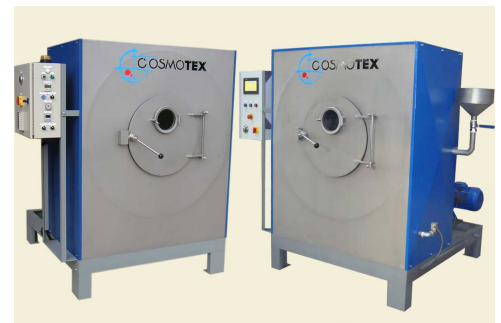
All SP models can be equipped with or without PLC and digital colour touch screen