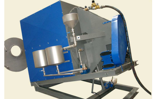
Automatic hydraulic unloading system.