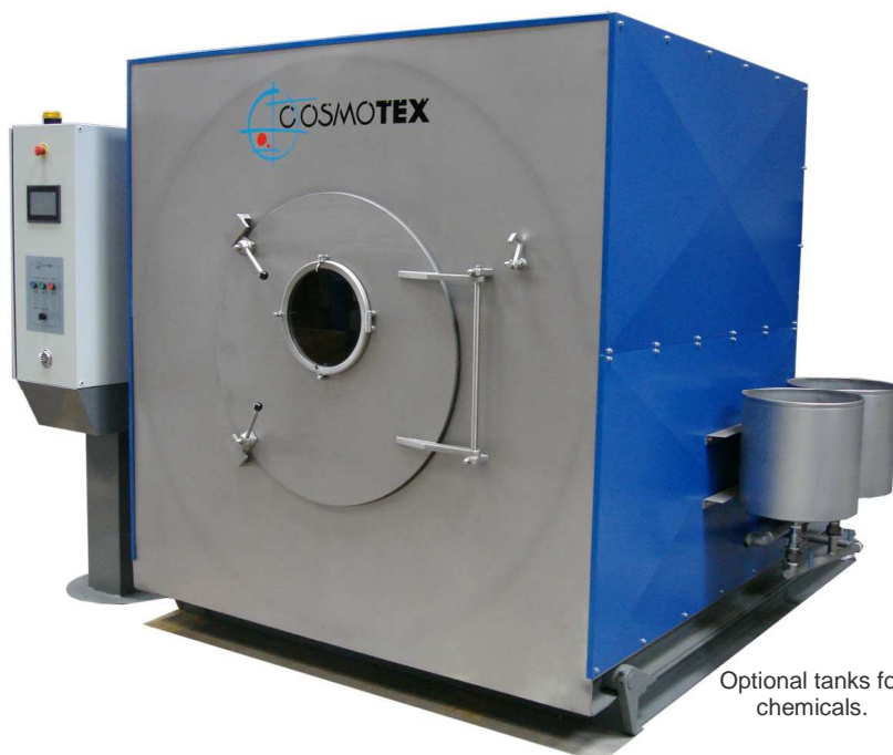
Optional tanks for chemicals.