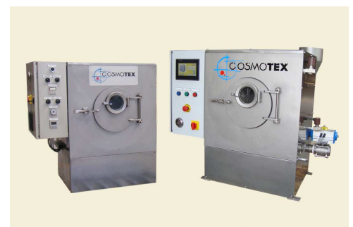
Machines for samplers for any process of stone,-wash, enzymes and so on