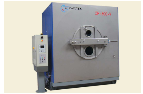
SP- 800 the biggest dry loading capacity for washing on the market

Technical features can be changed without previous notice